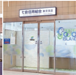
Shichitou Credit Association

The terminal offers shops, restaurants, and an ATM. Here you will find unusual foods as well as miscellaneous items from the islands.