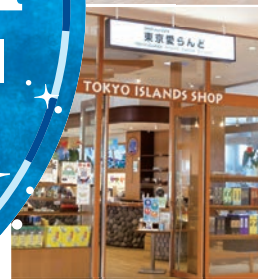
Antenna shop "TOKYO ISLANDS SHOP"