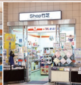
Retail Shop Takeshiba