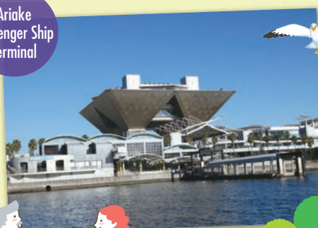
Ariake Passenger Ship Terminal