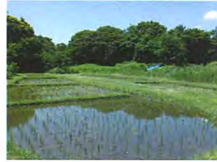
Enjoy the seasonal changes in the "Satoyama" a traditional Japanese landscape with rice fields, brooks, thickets and waterside wildlife and insect life.