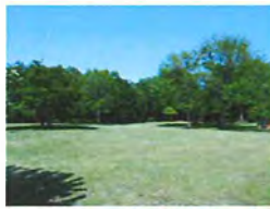
This large open field is ideal for a picnic lunch, a nap, or simply relaxing.