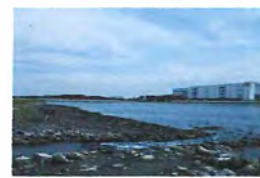
Sandpipers and plovers are frequent visitors during the spring and fall migrations, and in winter, many ducks can be seen here. The best view is from the Nature Center.