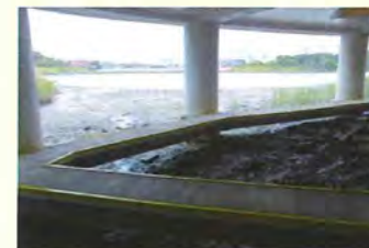
During low tides, get a close look at mudskippers and many invertebrates like crabs.