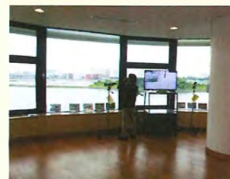
The observation lobby allows a great view of the Tidal Pond with scopes with a helpful ranger.