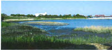
This brackish water pond is tidally influenced by seawater from Tokyo Bay. Low tide reveals tidal flats that attract mudskippers and crabs. The first of spring and the end of summer brings in migratory shorebirds to feed on the tidal flats.