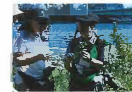
Tokyo Port Green Volunteer

Tokyo Port Wild Bird Park Group Administration