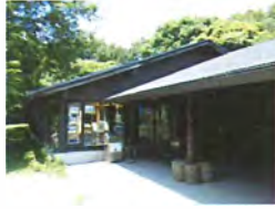
This Center is used for nature tours and craft-making classes.