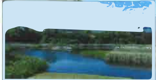
These rain fed ponds, surrounded by reed beds and forests, are home to grebes, kingfishers and herons. In the winter many duck species also attract hawk species as well.