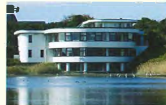
Large glass windows equipped with scopes in the Wildlife Viewing Lobby give visitors a comfortable environment to view the Tidal Ponds' birds. Rangers and volunteers are nearby to answer questions or enjoy exhibits to learn about the natural features and the history of the Park.