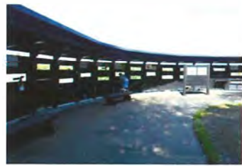
Visitors can easily observe wild birds in the East Freshwater Pond using scopes.