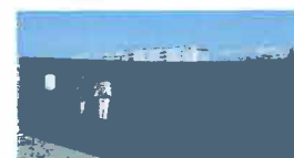
Enjoy a panoramic view of the shoreline using the various windows on the blind.

Note: There are staircases in Observation Hides #3 & #4.