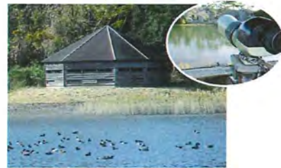
Observe the birds nearby using the scopes provided.